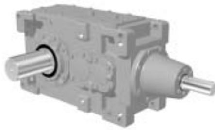
<Reducer: Right Angle Shaft Horizontal Mounting>